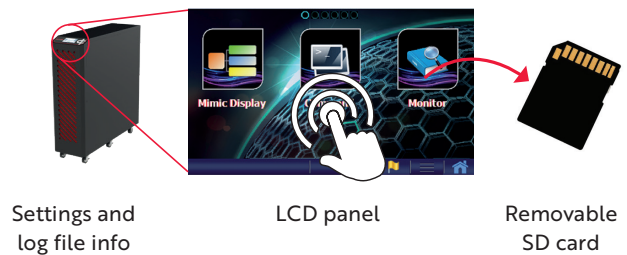
Settings and log file info

UPS settings and log file info up to 800 events can be easily downloaded to SD.