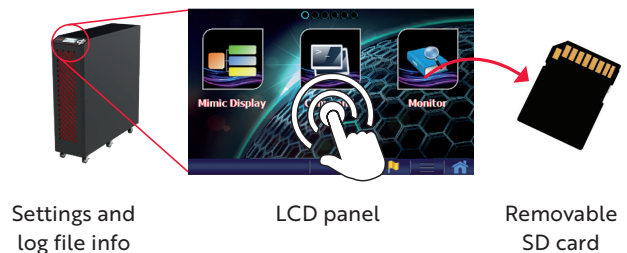
Settings and log file info

UPS settings and log file info up to 800 events can be easily downloaded to SD.